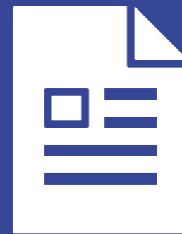
Young people with an EHCP