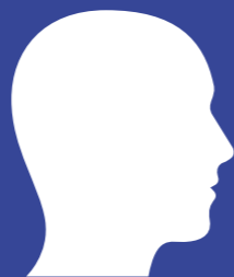
Speech & Language