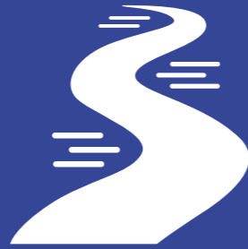
Young people who may be on the SEND pathway