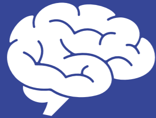
Young people with high anxiety, neurodiversity or emotionally based school avoidance